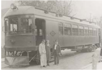
T.H.I.&E. Traction Car at Abner Creek, late 1920s