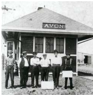
1910 depot station in Avon, Indiana