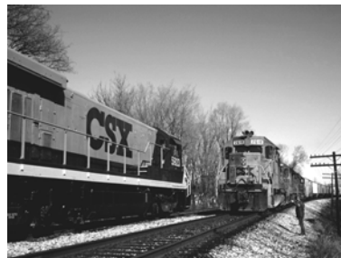
Today's trains meet on Avon tracks